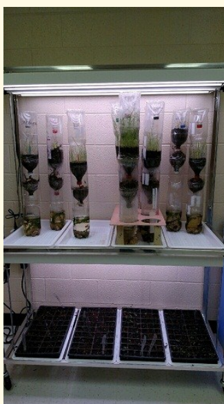
Grow Cart—a new purchase!