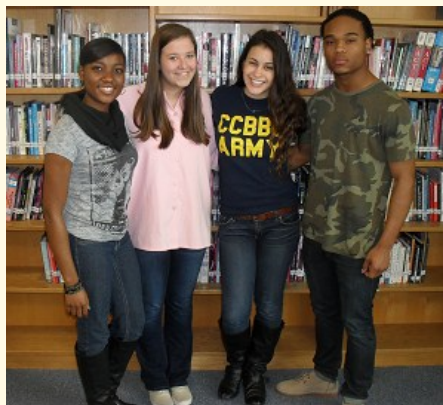
Central Academy Families

We are currently in the final grading period of this semester and have three weeks of instruction and review left before final exams. Report cards went home last Wednesday. Remember that as parents you can view your child's grades at any time by obtaining your parent password for the Parent Portal. Please stop in the main office with ID to get this information. Remember that each 6 week grade counts for 25% of your final semester grade, and the final exam itself counts for 25% of the final semester grade. Students should begin reviewing this month on their own for their exams and take advantage of all tutoring and review opportunities with teachers. The final exam schedule and study tips are posted in each classroom and are on the last pages of the Cougar Chronicle this week. We will be starting with the 4th period exam on Monday 1/13, so be sure you check out the schedule. All students are required to stay for all exam reviews. ALL students are required to take their final exams during finals week, and on the days scheduled.