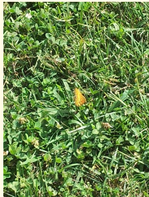
Above: A picture from the Nature Walk from a Student's perspective.