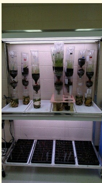
Grow Cart—a new purchase!