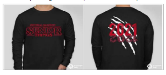
To place your order: Order by July 15th for Open House Pick Up

SENIOR CLASS T-SHIRT (black long sleeve t-shirt w/ red text & white scratch)