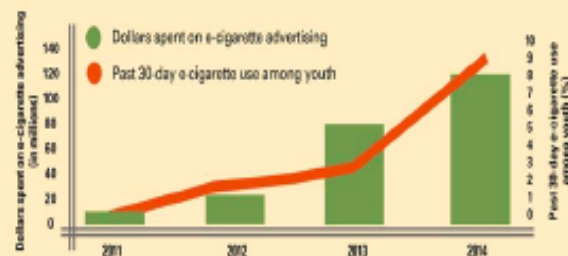
E-cigarette use among youth is rising as e-cigarette advertising grows

CDC, National Youth Tobacco Survey, 2011-2014; Cigarette Advertising Expenditures, 2011-2014