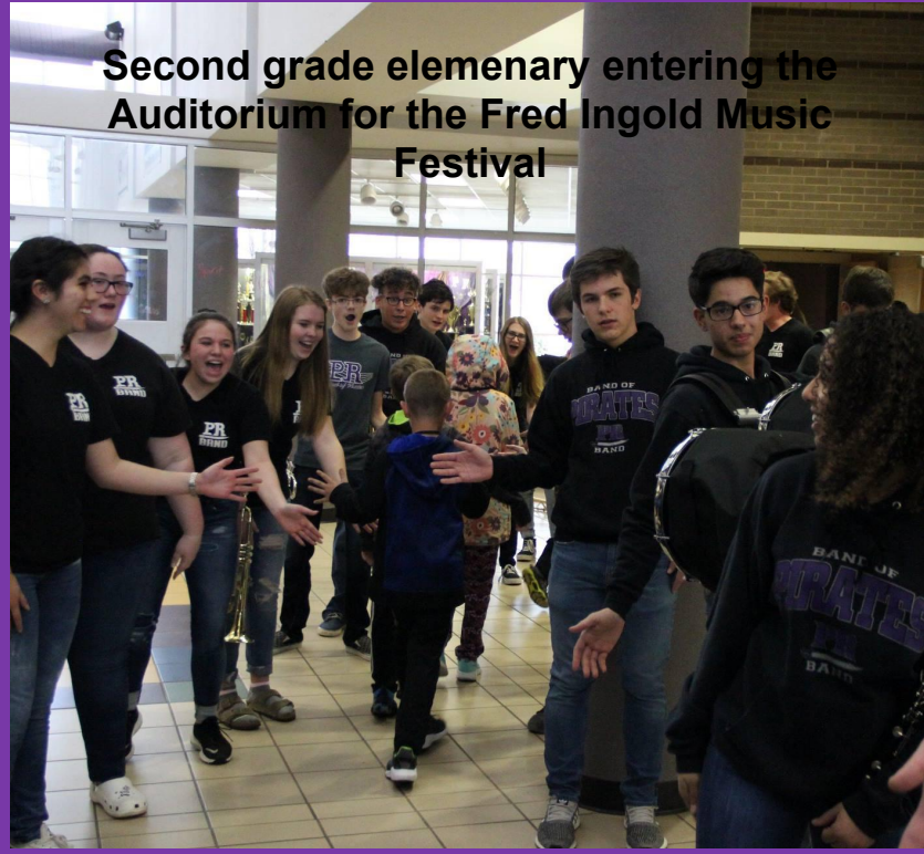
Second grade elementary entering the Auditorium for the Fred Ingold Music Festival