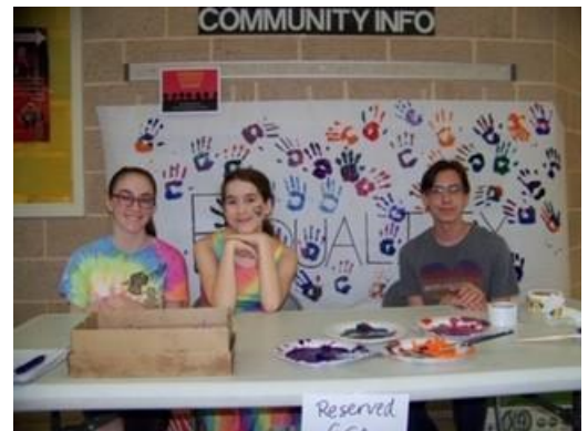
Students participating in Awareness Week