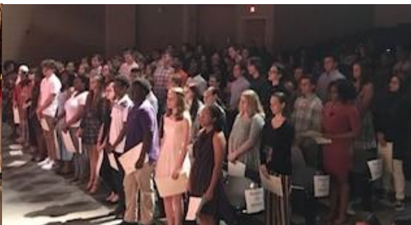
Beta Club Inductions