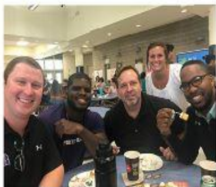
Walk your schedule and Meet Your teachers