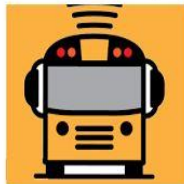
Get Transportation Information

8am- 9:30am 9th & 10th graders 10am- 11:30 am 11th & 12th graders