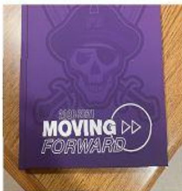
Buy Yearbooks and SpiritWear