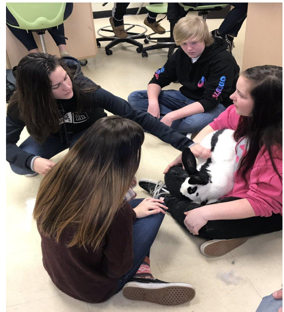
Animal Science class learning about small animals