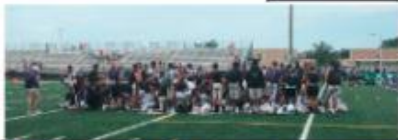
JV & Varsity football @ the first scrimmage of the season!