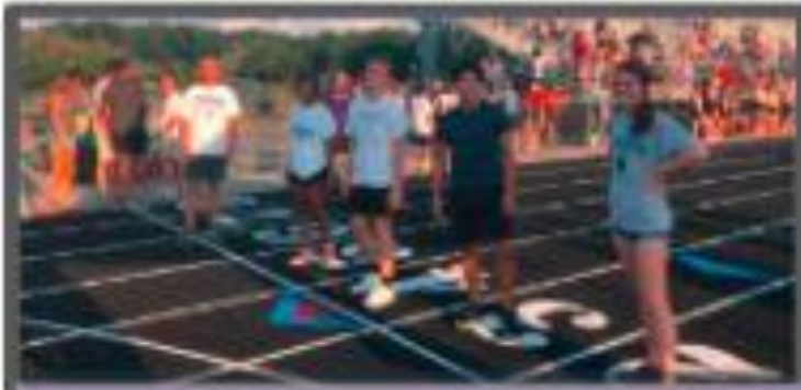
Pirate athlete relay at our Ribbon Cutting Ceremony!