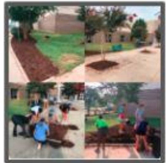
Students, Parents, and Staff helped in our very successful campus beautification day!