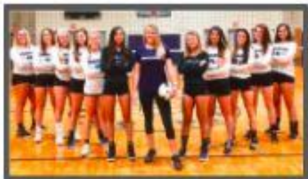
Varsity Volleyball Team!