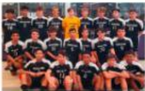
Varsity Soccer Team!

Think win-win! Have an everyone can win attitude!