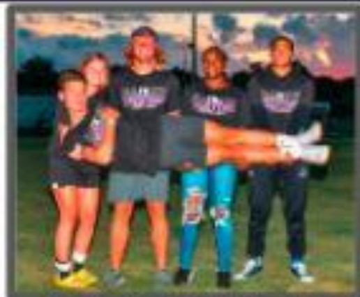
Your Fall 2019 student section leaders!