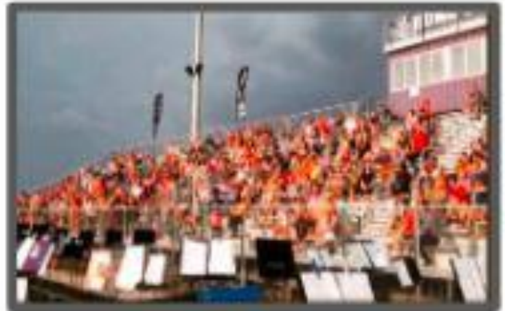
Our Community came out to support our band and athletics at Pirate Community Night!