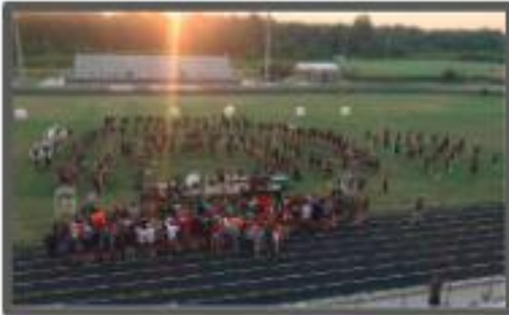
Band of Pirates plays our New Alma Mater while staff and students sing along!