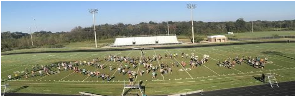
The Band of Pirates rehearse the field show.