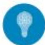
ACT ® Science