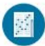
ACT ® English

Unlimited access to thousands of practice questions across all ACT ® and SAT ® subtests.