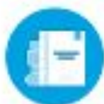
SAT ® & ACT ® Reading