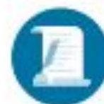
SAT ® Writing

Looking for more practice? Albert offers 100+ additional subjects to help support mastery.