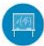
SAT ® & ACT ® Math