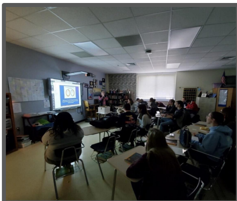
Students learn about coding in advisory this week!