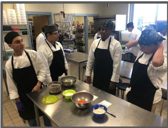
Culinary academy students taste test different dressings!