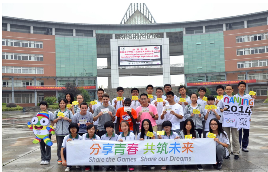
Student trip to Nanjing, China