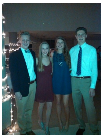
2nd Annual MRHS Sadie Hawkins Dance... December 6, 2014