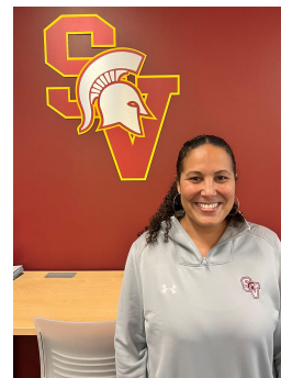
Ms. Jackson Ro-Z