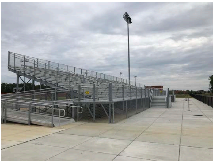
SVHS - Stadium complex views and most recently delivered practice field.